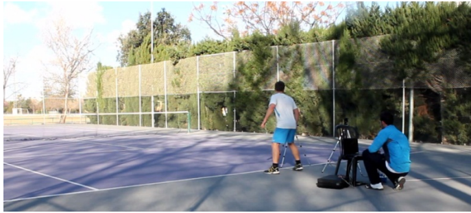
FIGURE 2: Location of photocells, tennis player and researcher before the start of sideward movement test.